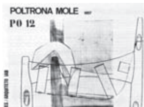
1. Soft Couch, Sérgio Rodrigues.

This individual, when he left FAU USP, was one that could design in several areas, he would choose the area on which he would concentrate, and this is why there were the four sequences: Project, Industrial Design, Visual Communication, and Urban Design. FAU USP's idea was a little utopic, I agree, but I think that it is still an extremely valid idea even today, of practically having a Project University. This was my great dream as a boy, to be able to participate and collaborate in the creation of a Project University. (...) Okay, what mattered was having all teaching as basic, all the teaching development, be it theoretical or practical, in a project. 1