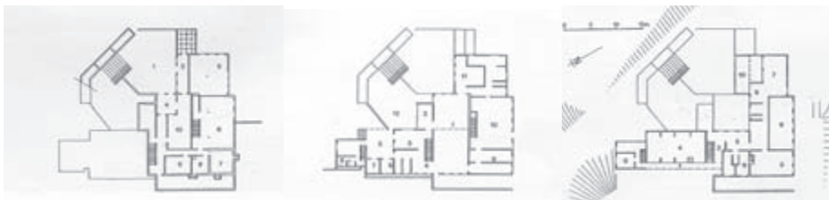
4. Studio-House in Zumikon (1967-68). Plan. In: Gimmi, Karin, 2G 29/30 Max Bill Architect , 210. © Max Bill, ProLitteris / SPA, 2013.

The house is situated in the green suburban area of Zumikon in Zurich where it looks down a hillside to the West and South. Bill's strategy was once more to design a house to suit the existing topographical contours, employing here an L-shaped plan that faces the rear of the site where it embraces a garden and a view of the sloped surrounding landscape. The topography led him to distribute his design among three levels including a ground floor, an entrance floor above and a lower floor (basement) (fig.4). The entrance is set in a low, elongated volume which, approaching from the driveway, is slowly revealed among the trees with a somewhat industrial aesthetic of hard lines and seamed white industrially produced panels. While the three storey structure is almost completely hidden at the entrance, in the terraced garden at the back one is able to comprehend the multi-level arrangement from a lower elevation.