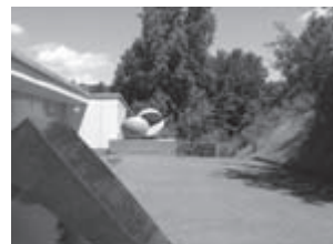
3. Studio-House in Zumikon (1967-68), Entrance façade.