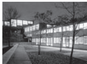
2. Hochschule für Gestaltung (HfG), 1950-55. In: Gimmi, Karin, 2G 29/30 Max Bill Architect , 112. © Max Bill, ProLitteris / SPA, 2013