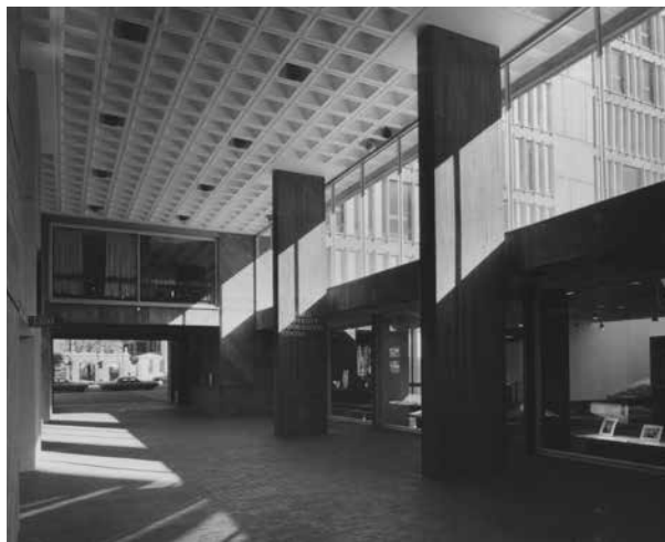
Fig. 4 Holyoke Center arcade

Sert (1963, p. 192) described the Holyoke Center as “a bridge between the educational buildings and the student dormitories or houses on the Charles River,” and it serves this function literally as well as programmatically, as a means of passage between the two realms. Reflecting Sert’s civic preoccupations, plazas fronting Massachusetts Avenue and Mt. Auburn Street are linked by the arcade that aligns with Harvard’s Wadsworth Gate (1857) and leads indirectly to the undergraduate “Houses” to the south (Fig. 4). Conceiving of this covered passage as a public zone, opening directly to Harvard Square and its transportation systems, he anticipated not only that “this arcade will be the most animated area of the block” but also that it “could set a pattern for other similar developments around Harvard Square” (Sert, 1962, p. 134; n.d. c, p. 4). Although Sert had the arcade and its ground floor commercial spaces paved in brick to amplify their intended character as extensions of the sidewalk and introduced natural light through a clerestory level facing southeast, the public qualities of the volume were not readily apparent, owing in part to the relatively low proportions of its entrances in relation to the building as a whole. As a result mid-block pedestrian traffic was insufficient to insure the economic viability of its independent commercial venues, and the spaces that lined the