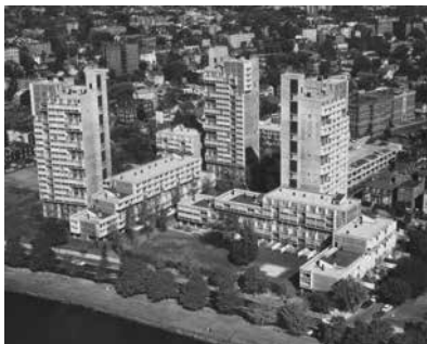
Fig. 6 Peabody Terrace, aerial view from Charles River.

With the growth of the University and the development of the Charles River bank there is no doubt that the open space system should find a design climax around the open space provided by the river. High rise [sic] buildings logically belong there and they will require plenty of open spaces between them. They should not be clustered like the downtown office buildings but widely spaced like the bell towers of the old churches. Between high buildings, lower walk-up structures with sunny courts can maintain the scale of the old Cambridge neighborhood unchanged.