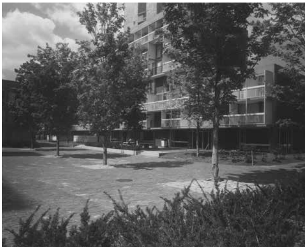
Fig. 8 Peabody Terrace, children’s playground