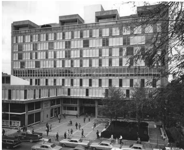
Fig. 5 Holyoke Center and Forbes Plaza from Massachusetts Avenue.

Sert conceived of Forbes Plaza as a means to forge a connection across the busy thoroughfare to the Harvard campus. In preliminary notes for a lecture of March 1956, he commented that Harvard Yard and Harvard Square "are as different as heaven and hell" (Sert, 1956b, p. 3). He reiterated this point at the GSD's first urban design conference the following month by comparing the two spaces: "In Harvard Yard the buildings are harmonious, dignified and well-scaled. The relationship to the open spaces they define is correct—Beyond the gate there is only noise, disorder, lack of visual balance, and lack of harmony" (Sert, quoted in Urban Design , 1956, p. 97). Yet as William Wurster (1959, p. 167) subsequently observed: "What makes the Harvard Yard